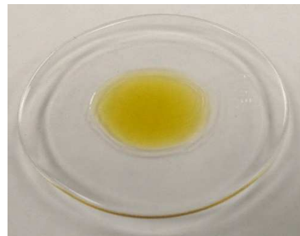
Product of Vermont USA