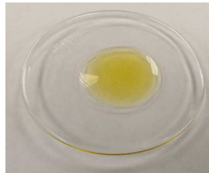
Product of Vermont USA