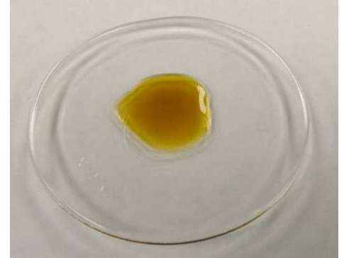
Product of Vermont USA